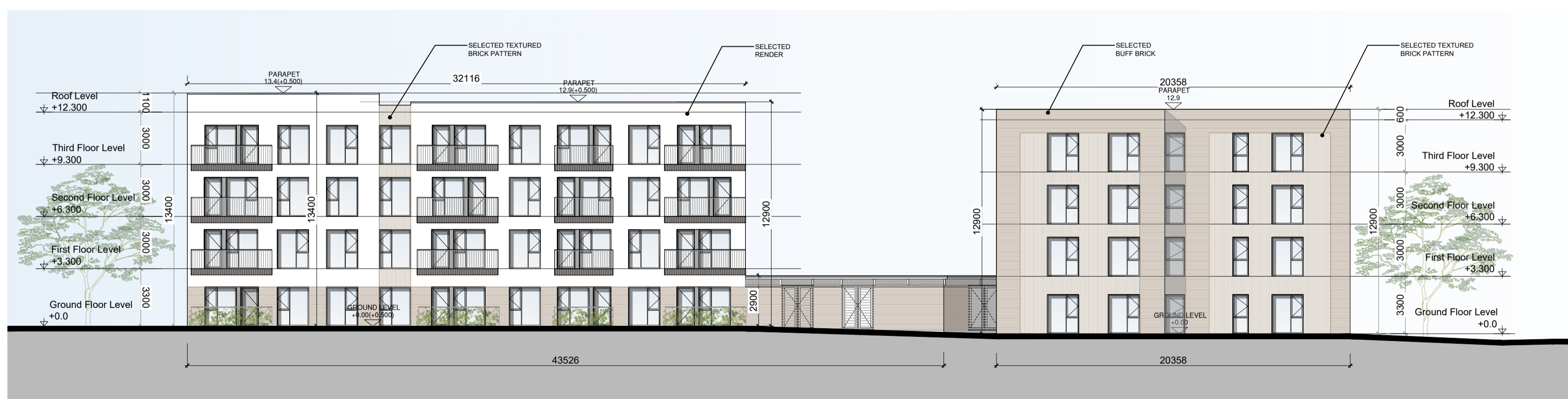
04 SOUTH ELEVATION SCALE 1:200 @ A1