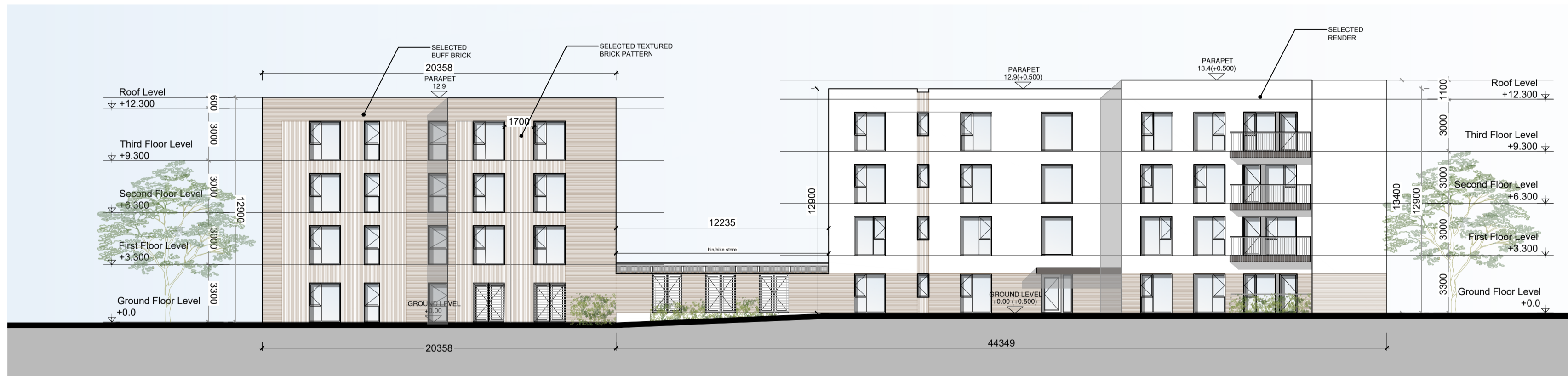
03 NORTH ELEVATION SCALE 1:200 @ A1