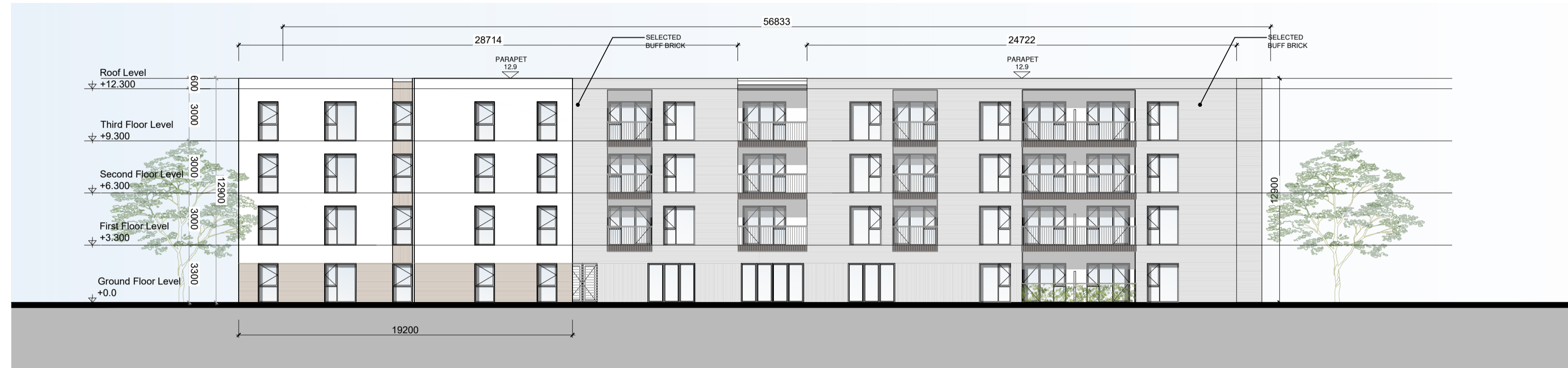
02 WEST ELEVATION SCALE 1:200 @ A1