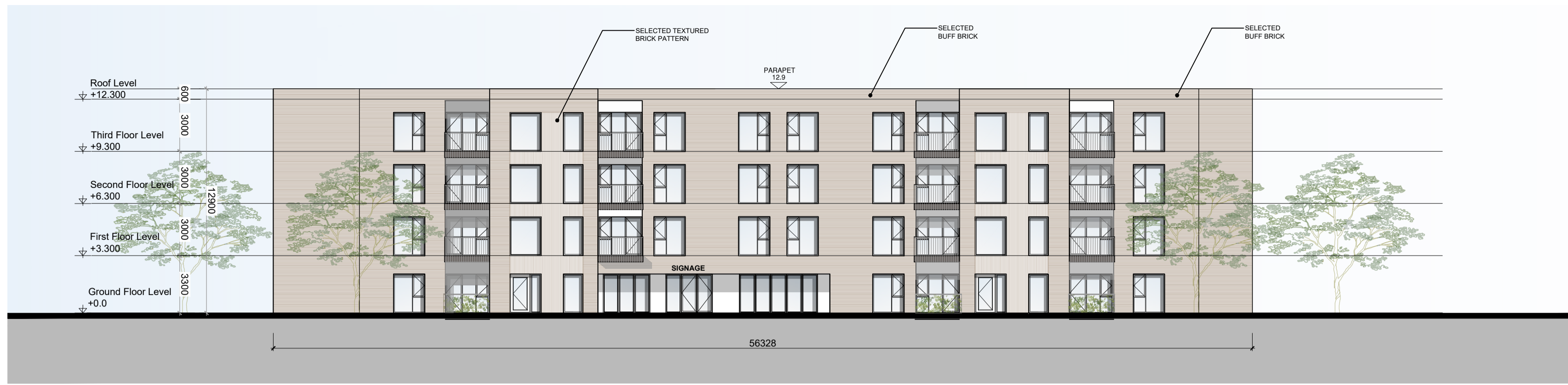
01 EAST ELEVATION SCALE 1:200 @ A1